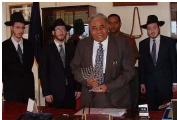
Fiji - President Ratu Josefa